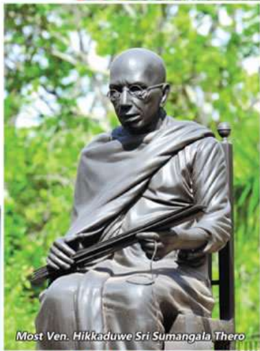
Most Ven. Hikkaduwe Sri Sumangala Thero