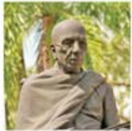
Most Ven. Hikkaduwa Sri Sumangala Nayake Thero